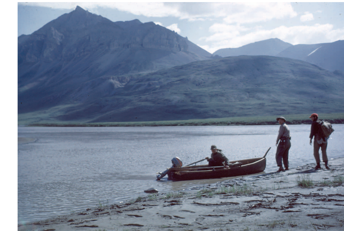
Field work by boat on Galbraith Lake, 1950. Galbraith Lake lies along the Trans-Alaska Pipeline and Dalton Highway which were built about 20 years after this photo was taken.