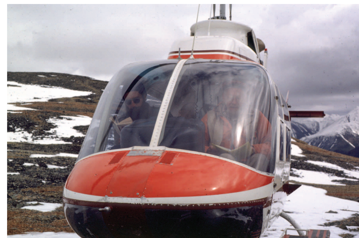
Bill taking notes in a warm helicopter bubble on a cold day in the Wiseman quadrangle in 1981. Helicopter pilot Cy Asta reading book at left.