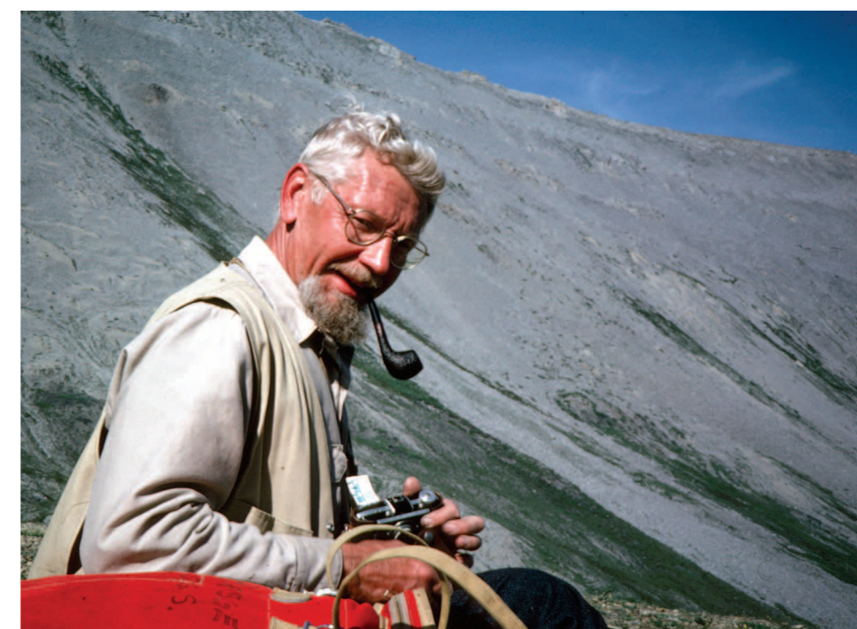
Mapping the Philip Smith quadrangle, 1976.