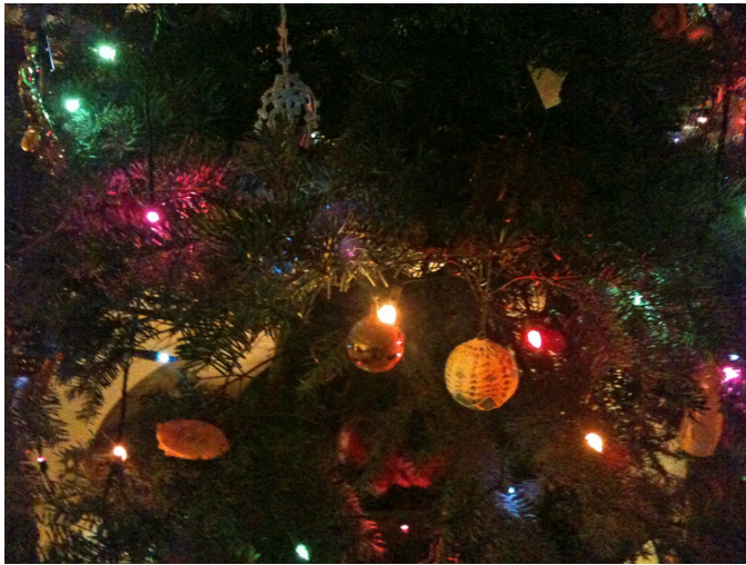
Ornaments old and new