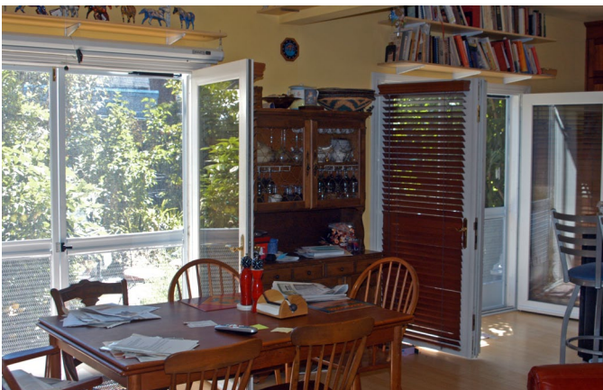
Two pair of French doors make it bright