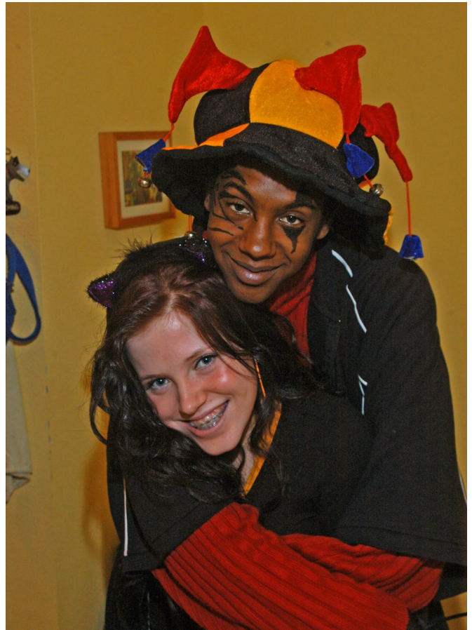
bf and gf