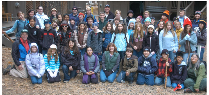
Group photo of sixth-graders

Yosemite seems to make it into each year at least three times. I think we made it four this year counting hauling Button over Tioga Pass and back. I spent yet another week this November with my dozens of eleven-year-olds from Sacramento County.