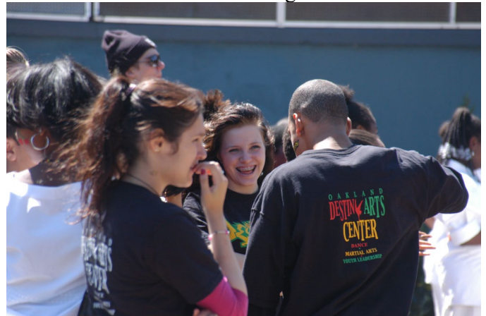
Before final presentations