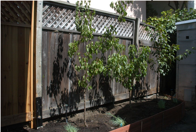
New planter, Trex wall, and water system