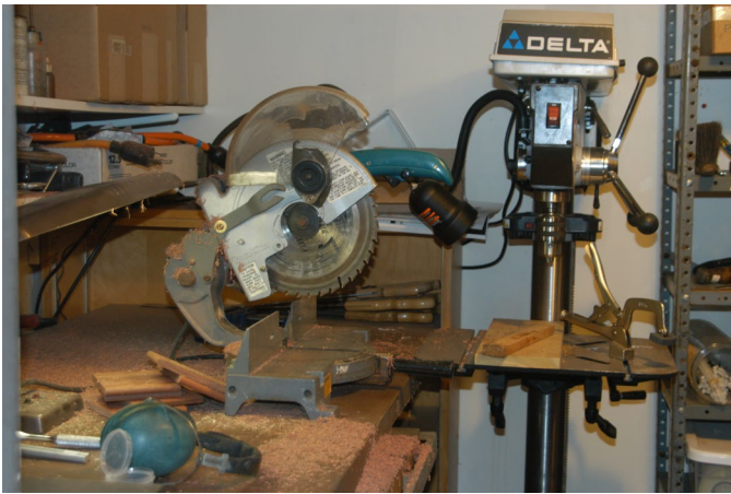
I can make trouble with these toys.