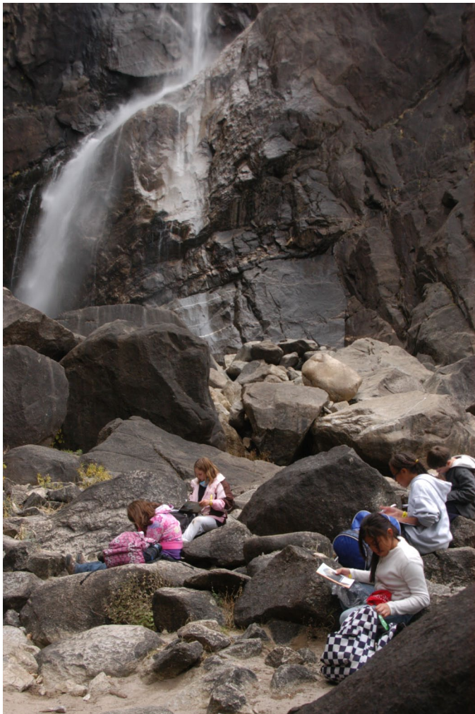
Yosemite with sixth-graders