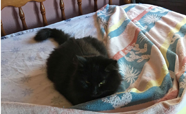
Mocha helping make the bed.