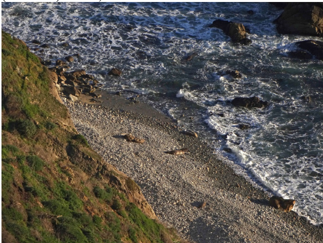
Elephant Seals at Point Reyes.