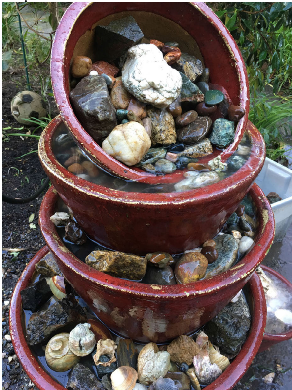
This also gave our pet rocks a home.

We found this nice set of pots, drilled holes in the bottoms, and put in a pump. As racoons and neighbor cats use it for drinking water plus some loss to evaporation, one of the valves on the new drip system will top off the fountain a bit each week.