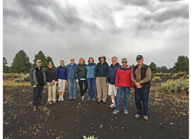
A bunch of scruffy Earth scientists on the basalt.

My group at the U.S. Geological Survey had a face-to-face meeting in Flagstaff where I got to work with my colleagues and visit some of the authors whose papers I review. While we were there, we got to go out to the crater field where the Apollo astronauts were trained about geology by our folks at USGS. We made an evening trip to Lowell Observatory which where Pluto was discovered.