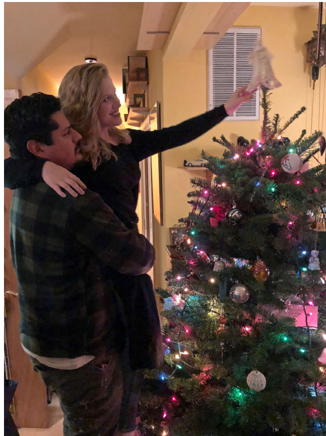
Angel on Top.