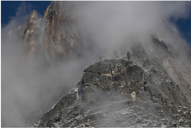
Student presentation shot.

The fruit trees were taking over the barbeque and the space where the broken hot tub was not being used so we went back to the same shop as 15 years ago and matched the stone. A little use of a rock hammer and a grinder, and it is a nice surface; cooking out there is nice.