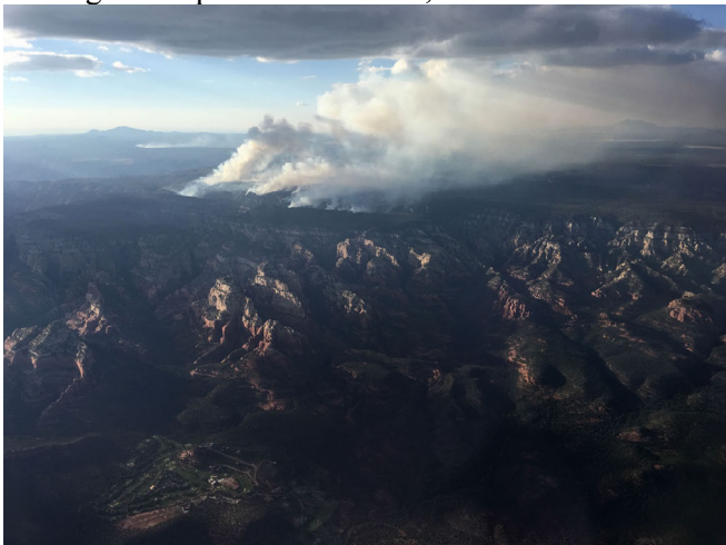
Fire on the Plateau.

Speaking of fires; this one was below the radar on the national news. This is a picture I took of the Cat Fire on the Kaibab Plateau in northern Arizona this year. It was about 4,000 acres so much smaller than the tragic Camp Fire in Paradise, California.