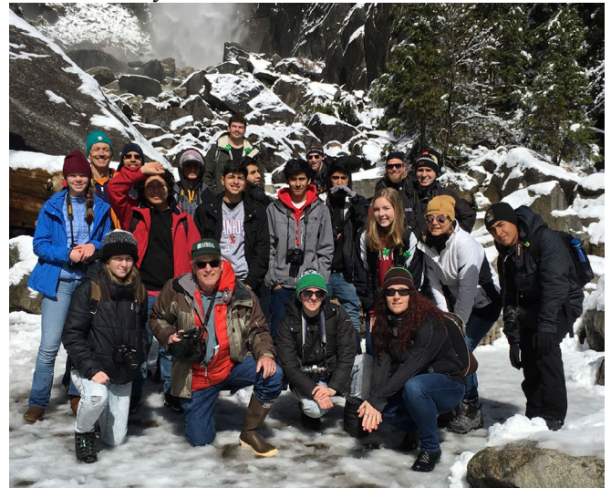
Advanced Photography class.

I got invited to help teach the Advanced Photography class at Mountain View High School again (first time was 16 years ago). I talk about Yosemite geology more than pictures. If they want to take a photo of a waterfall, they have to listen to me tell them about Pleistocene glaciation, granitic rock, and uplift history of the Sierra. These are gifted and talented artists and it was a blessing to see them do their creativity.