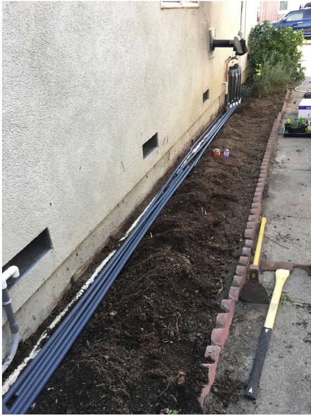
Two pipes to the front and four pipes to the back.

We found this nice set of pots, drilled holes in the bottoms, and put in a pump. As racoons and neighbor cats use it for drinking water plus some loss to evaporation, one of the valves on the new drip system will top off the fountain a bit each week.