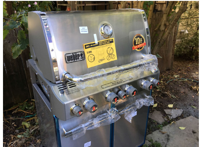
This one has a weather-resistant cabinet for supplies including the tank. The two shelves are not attached yet in this shot.

After a decade and a half, our old Weber needed replacement. We've grilled rain or shine commonly a few times a week. This new unit has a rotisserie so we turned a 23-pound turkey on the spit for Thanksgiving (and had two 16-pounders in the oven).