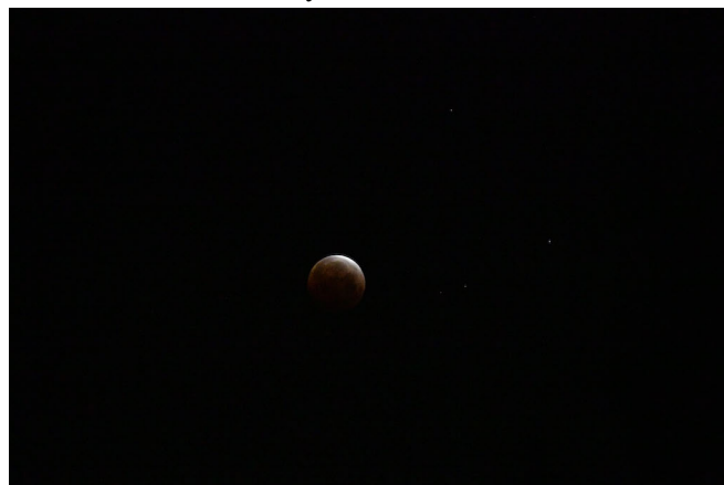
The Moon on May 26, 2021

May brought us a full lunar eclipse and we didn't have to leave the back yard to view it.