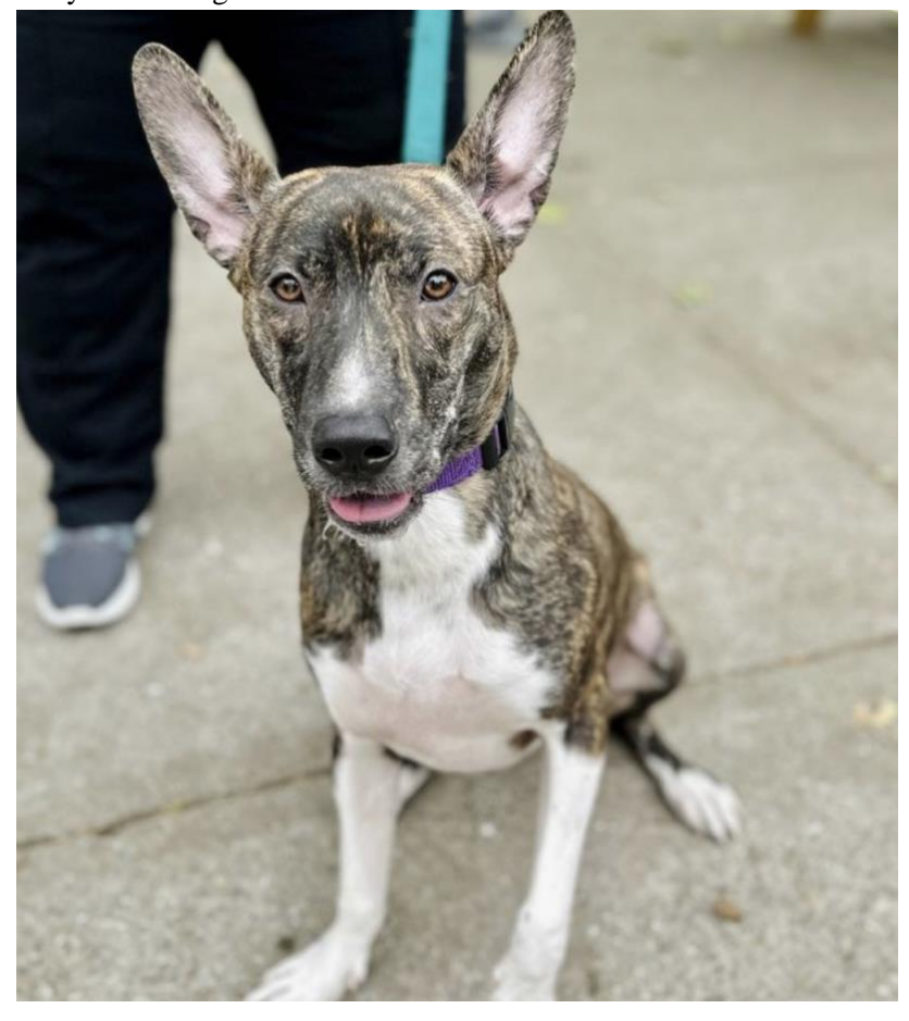
{\it Meet Velvet. \ She is about one year old and half the size of either of the other dogs.}