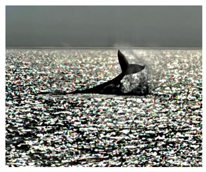
The Humpbacks were in rare form.