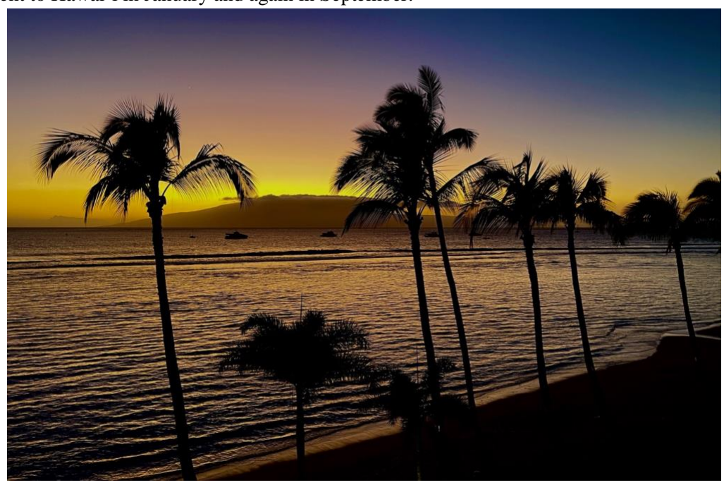
We stayed in Old Town Lahaina a few weeks before the fire.

We went to Hawai'i in January and again in September.