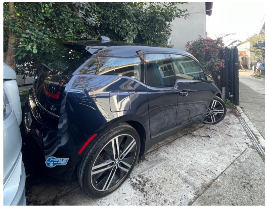
Both the van and the car fit in the back yard.

We got an electric car. It is a BMW i3. We sold the '61 Chev pickup (Hillary).