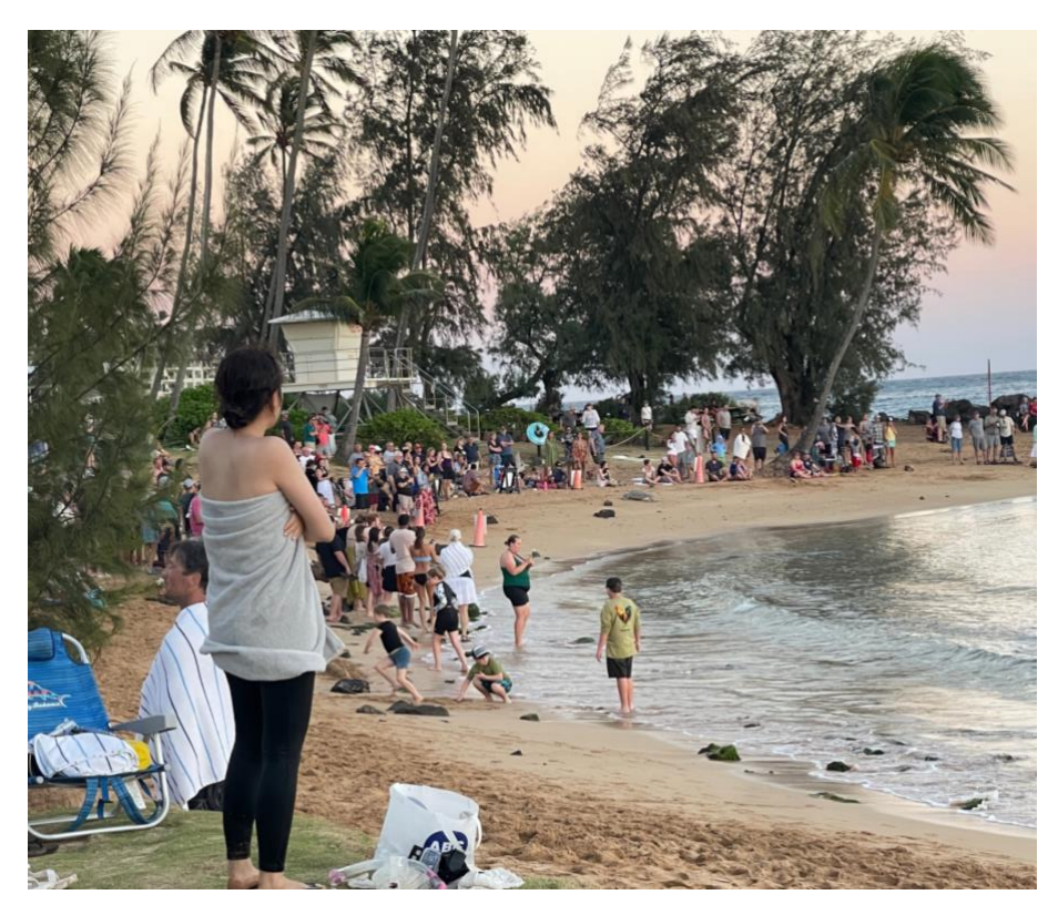
Sea turtles at Brennecke's beach in Poipu.

We got an electric car. It is a BMW i3. We sold the '61 Chev pickup (Hillary).